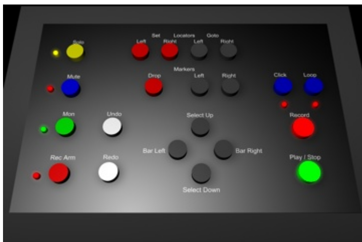
Render of what it might look like

The remote consoles will only have a DINx3 and a DOUTx3 inside. They will patch into the DIN/DOUT chain via Cat5 at the main console. Software is stock standard 64e.