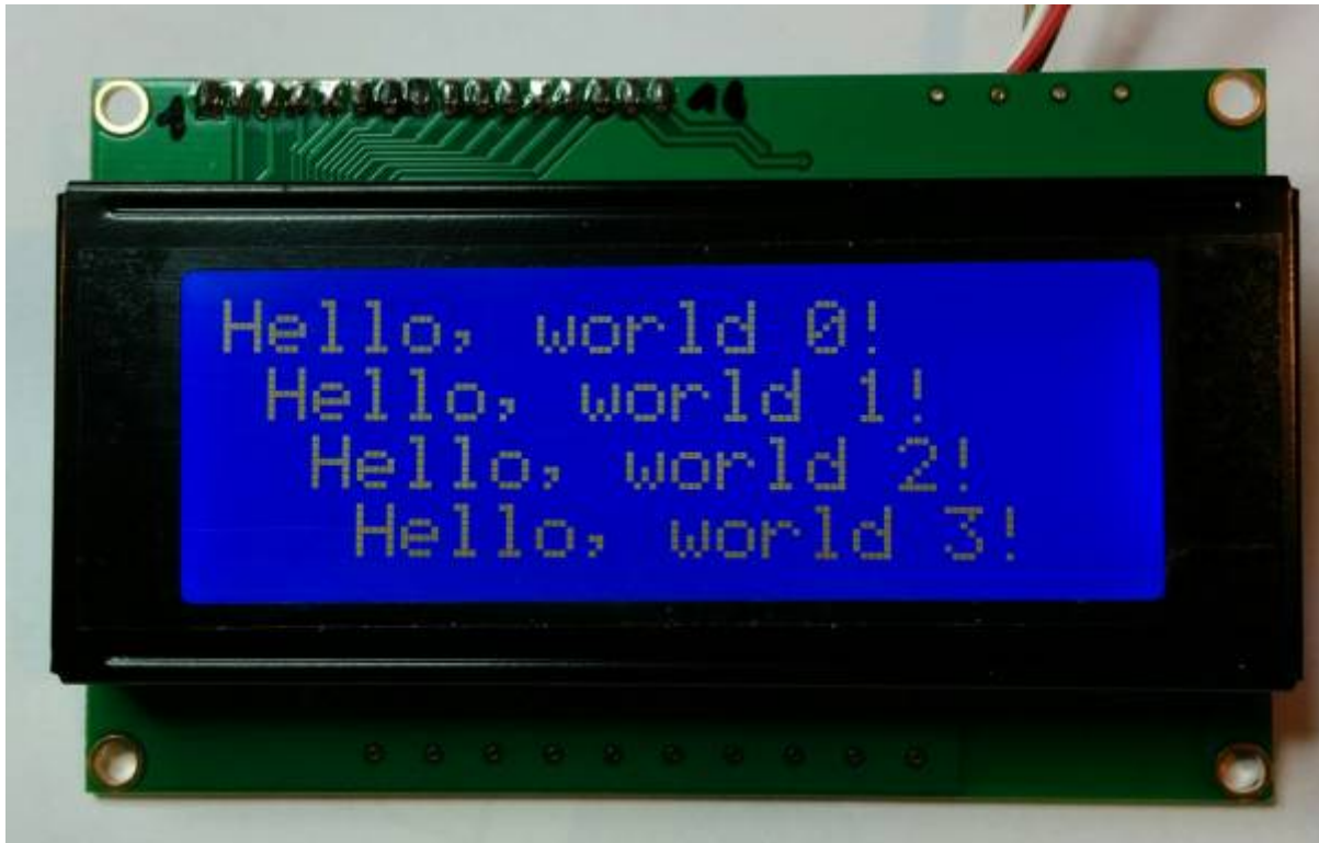
This is a 4x20 CLCD

An LCD module isn't an MBHP module, you buy the LCD screen with the PCB attached and driver chips on-board, and that is your LCD module. Here you can find information how to use an LCD with the Midibox MBHP Core module. See also: Troubleshooting LCD Displays