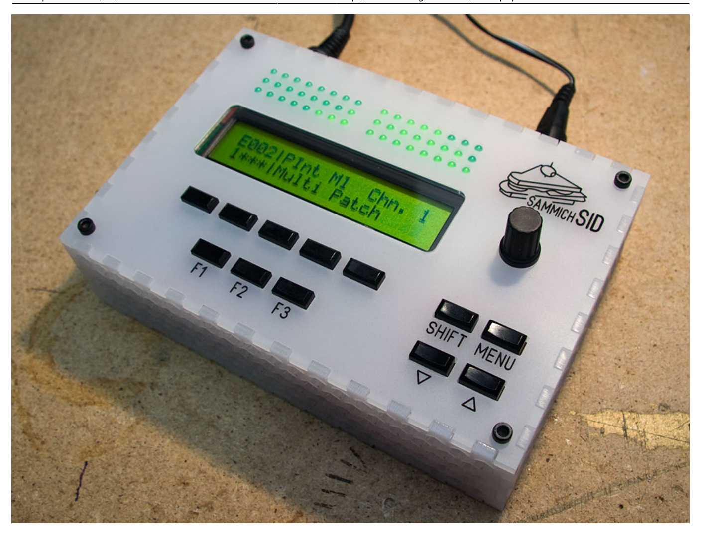
The discussion thread where you can read the latest info and post questions about sammichSID kits is here.