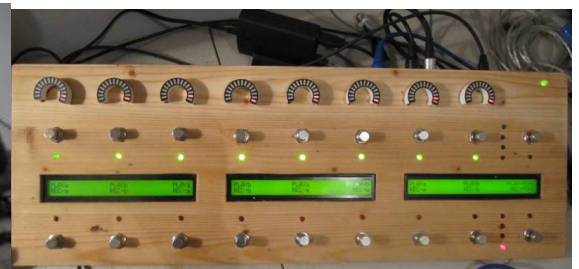
beta in action - youtube