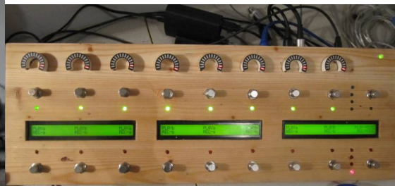
beta in action - youtube