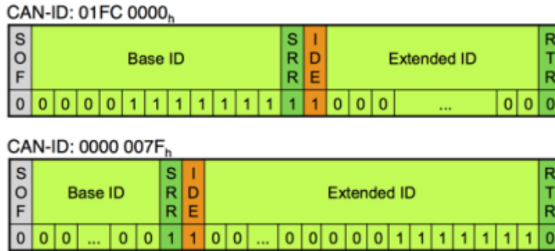
Two examples of Extended (29bit) ID.

We can mix both formats on the same buss without any trouble.