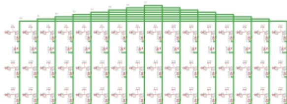
G0-G7 control LED columns