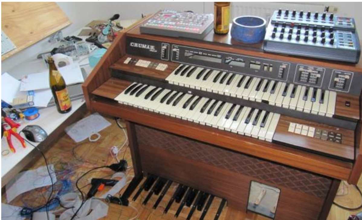
a other 32bit Variante built in on the Upper-Manual in Crumar 198, UI-controlled via a BCR2000

it was a 8x8 LED-Matrix, with 2x8 Buttons, on Breathboard