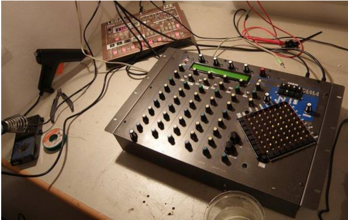
Tekkstar in use

it was a 8x8 LED-Matrix, with 2x8 Buttons, on Breathboard