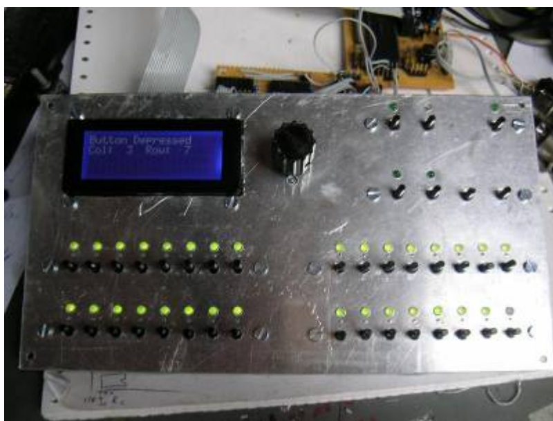
dseq32 by mess. Hooray!